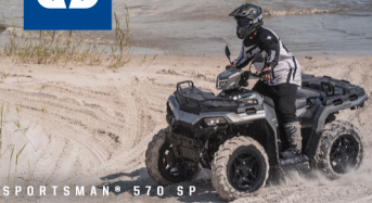
SPORTSMAN® 570 SP