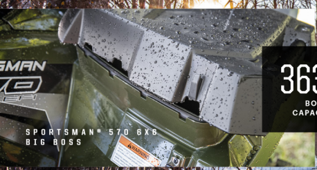
SPORTSMAN® 570 6X6 BIG BOSS