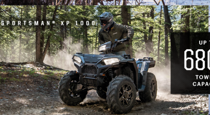
SPORTSMAN® XP 1000