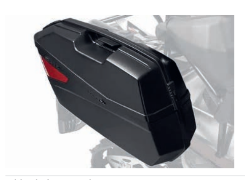
Sidewinder & SRViper