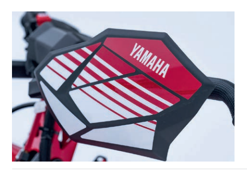
Sidewinder SRX 2022