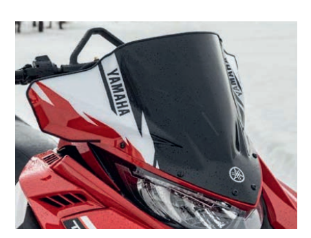
SRViper & Sidewinder