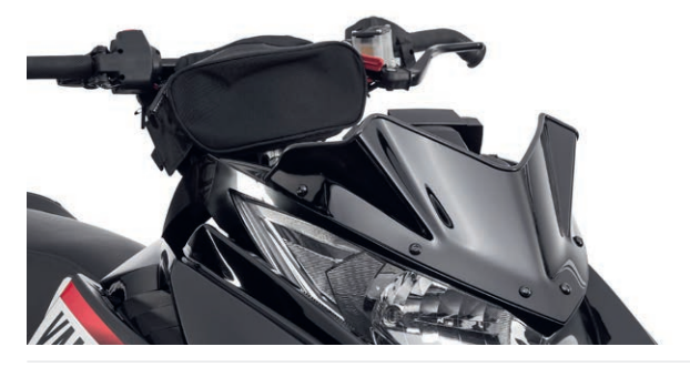
SRViper & Sidewinder