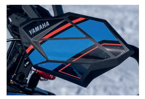
Sidewinder SE 2022