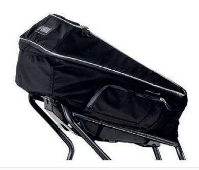
Sidewinder & SRViper