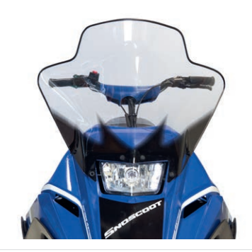
SnoScoot ES, SRX120