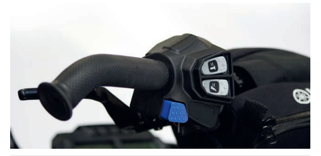
Sidewinder & SRViper

• 1/4" thick high molecular weight polyethylene.