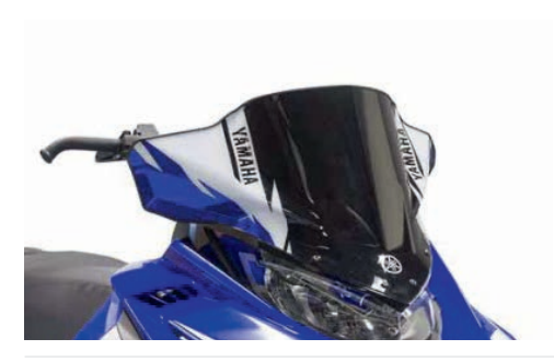
SRViper & Sidewinder