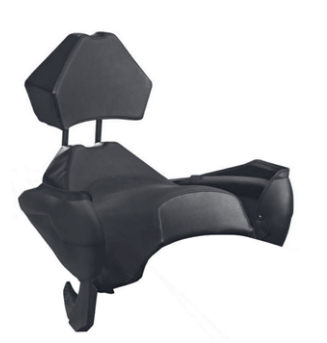
SRViper & Sidewinder X-TX, L-TX, B-TX