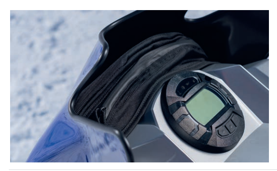
SXVenom, SXVenom Mountain, RSVenture TF, Transporter Lite, Transporter Lite 2UP, Siderwinder SRX LE, Sidewinder S-TX GT EPS