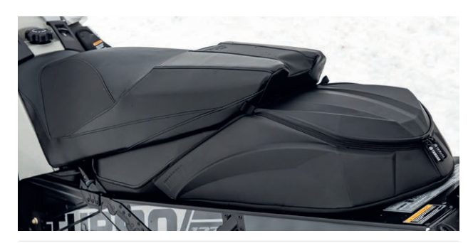
Sidewinder & SRViper

• Simple secure installation to the handlebars