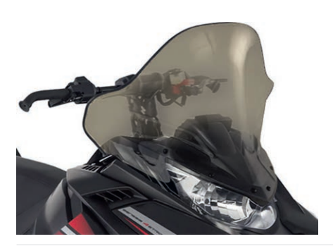
SRViper & Sidewinder