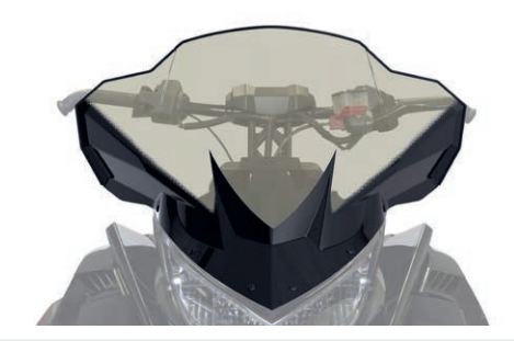
SRViper & Sidewinder