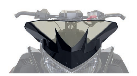
SRViper & Sidewinder