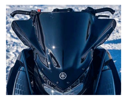
SRViper & Sidewinder