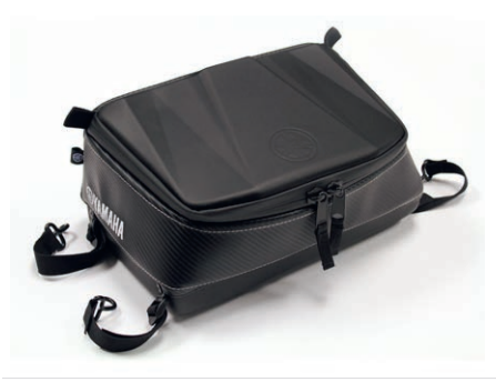
SRViper & Sidewinder X-TX, B-TX & M-TX