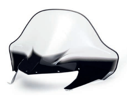
SRViper & Sidewinder