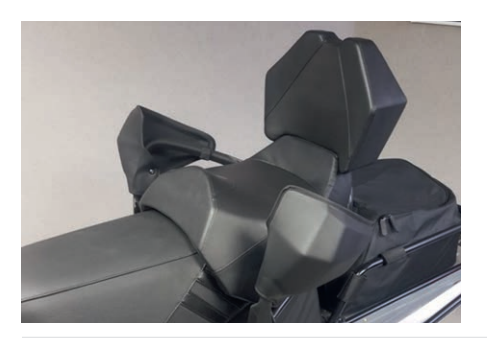
MP600 & MP 800 Transporter