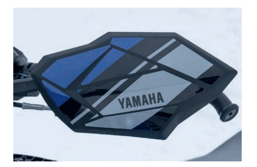
Sidewinder LE 2022, SXVenom