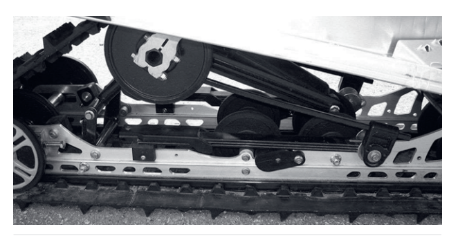
MP600 & MP 800 Tranporter, Sidewinder 146 GT