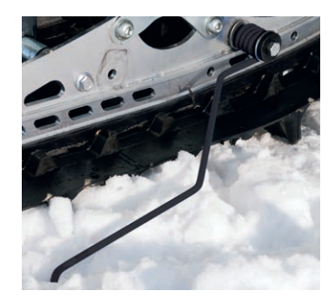
Fits all except SRViper & Sidewinder