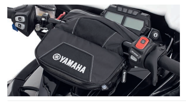
Sidewinder & SRViper

• Made of durable, weather resistant nylon.