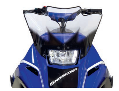
SnoScoot ES, SRX120