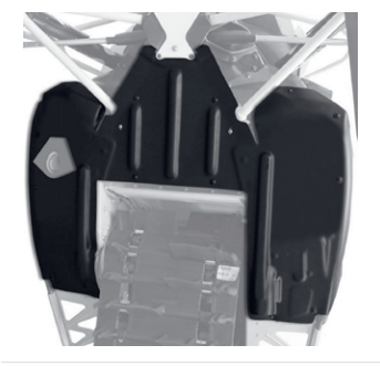
Mountain Max 154

Includes wire harness with disconnect coupler and passenger control switch